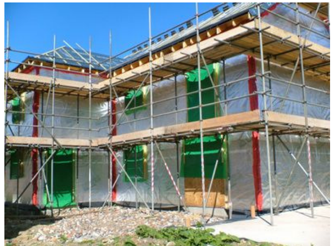
The Peter's Self-build

Once they received planning permission and conducted an archaeological dig, they quickly prepared the site to receive